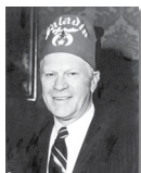
Gerald Ford Former President