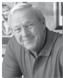
Arnold Palmer Golfer