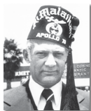
Buzz Aldrin Astronaut

A number of past and present heads of government, business leaders, entertainers and sports legends have been Shriners. They include: