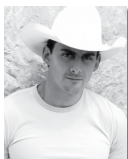
Brad Paisley Country Singer