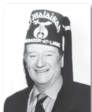
John Wayne Actor

Help Interest Others in our Great Fraternity